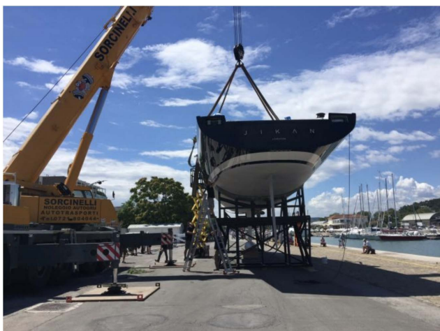
Sailing yacht JIKAN launched