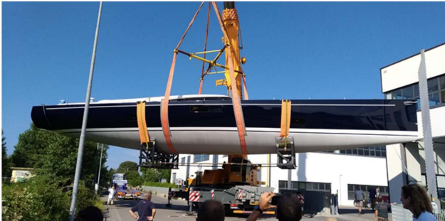
sailing yacht JIKAN to hit water

The exterior layout places two C-shaped sofas and alfresco dining tables within the cockpit with raised sun pads immediately behind. The helm station is placed close to the stern and the foredeck has room for sunbathing and observation when the sails are down.