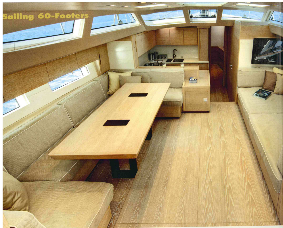
Advanced 66: Nauta Design came up with this modern exterior and interior, whilst Reichel Pugh created the superfast hull lines.