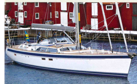
Hallberg Rassy 64: the Swedish builder's flagship is built for ocean sailing. The helmsman is well protected in foul weather.

Hallberg Rassy has been building robust sailing yachts in the southern Swedish town of Ellös for 39 years now and recently unveiled its new flagship, the Hallberg-Rassy 64. The 19.85-metre Germán Frers design is a semi-custom yacht made of GRP; she displaces 36 tonnes and handles well in heavy weather, featuring as she does a trademark windscreen and spray hood. The aluminium mast on this 5.20-metre-beam sloop sports 173 square metres sail when close-hauled, balanced by 12.7 tonnes of ballast on a 2.50-metre-draught keel. A spacious engine room houses a 206 kW Volvo Penta diesel, which provides power when the wind has dropped. The interior layout can be customised and there is a choice of 72 different versions. Price from 2,516,000 Euros (exc. VAT), hallberg-rassy.com